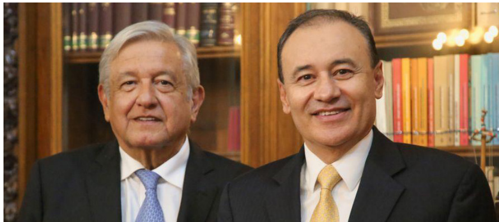
Andres Manuel Lopez Obrador, president of Mexico (l), and Alfonso Durazo, governor-elect of the state of Sonora, Mexico.

We will take advantage of all available cooperation mechanisms such as the United States–Mexico–Canada Agreement (USMCA); the Mexican consular network in Arizona, through the Ministry of Foreign Affairs of Mexico; and the Sonora–Arizona Commission and