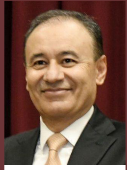
Alfonso Durazo Governor-elect of the state of Sonora, Mexico

Moreover, I do understand current issues of concern, such as the management of our natural resources, especially water. I'm convinced that we will have to establish a shared strategy to face the current drought, but I have no doubt that, as on previous occasions, we will move forward together as allies, partners and friends.